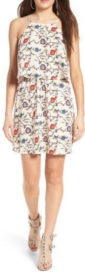
Floral Popover Dress from Lush - $49