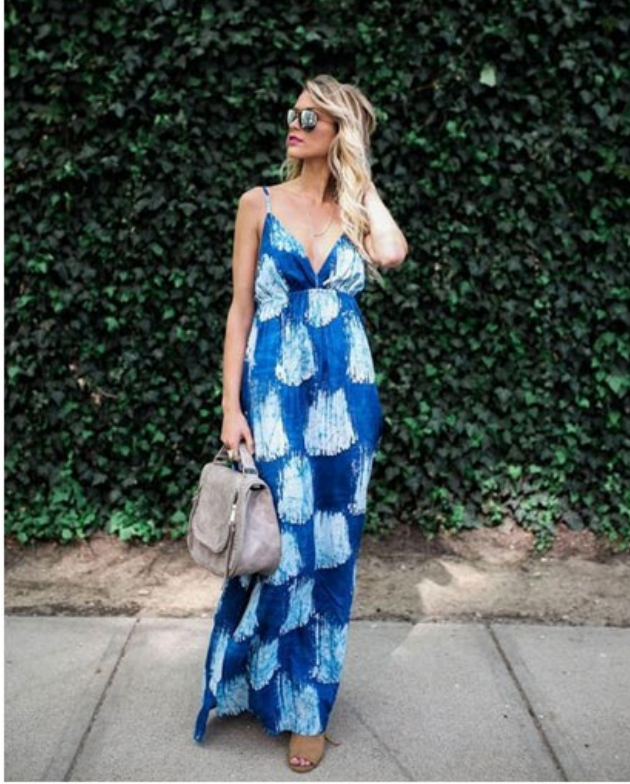
Seastone Maxi Dress from Vici - $54