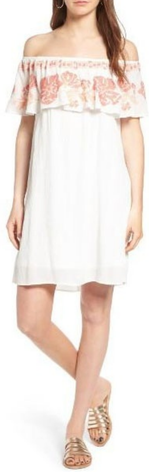
Embroidered Off the Shoulder Dress from Sun & Shadow - $55