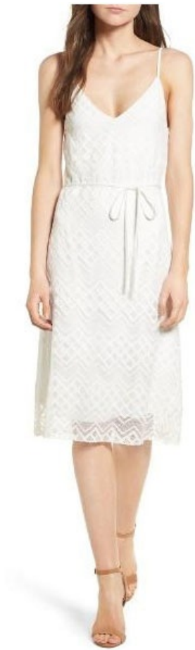
Tie Waist Lace Midi Dress from Love, Nickie Lew - $55