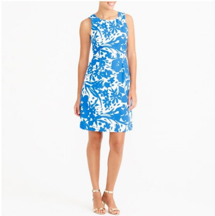
Printed Pleated Shift Dress from JCrew Factory - $54.50