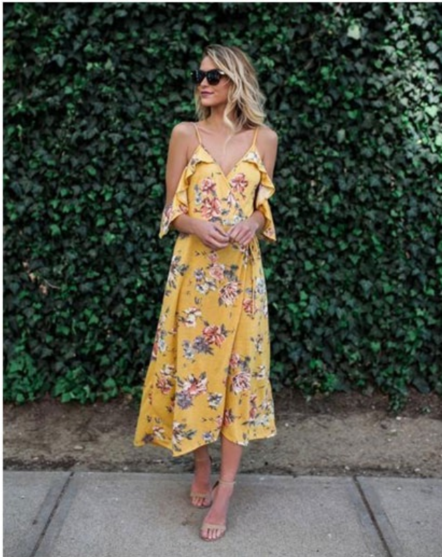
Garden Delight Cold-Shoulder Summer Dress from Vici - $52