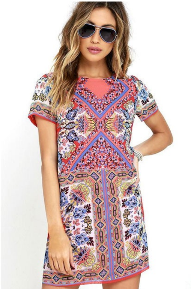
Sangria Coral Pink Tile Print Shift Dress from Lulu's - $48