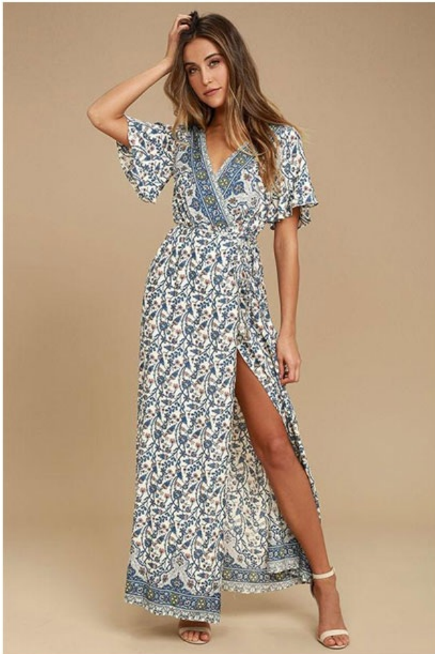
Amabella Cream Print Wrap Maxi Dress from Lulu's - $59