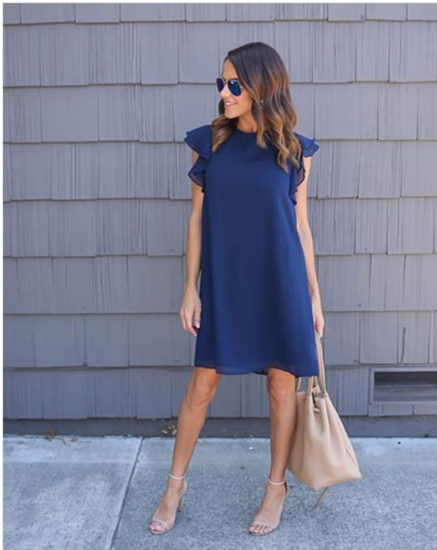
True Bliss Flutter Dress from Vici - $54