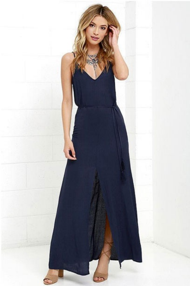
Fresh Air Navy Blue Maxi Dress from Lulu's - $52