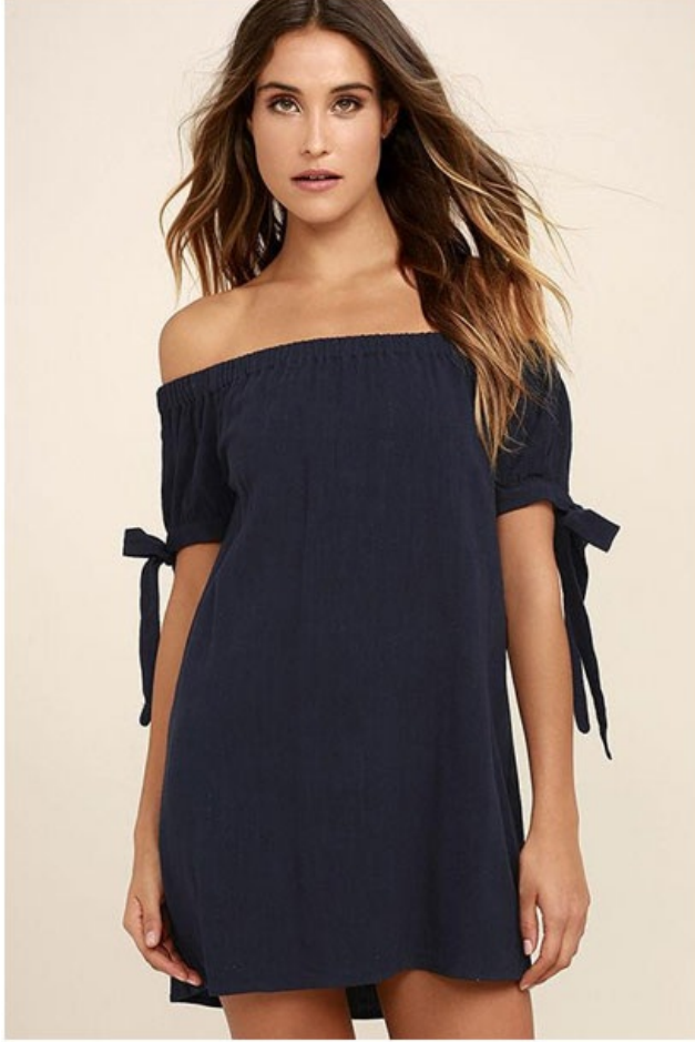
Al Fresco Evenings Navy Blue Off-the-Shoulder Dress from Lulu's - $48