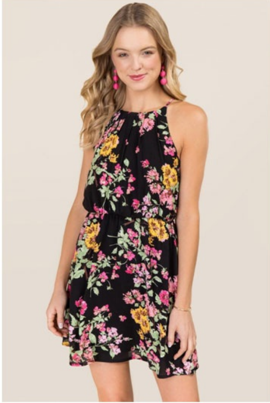
Lola Floral A-Line Dress from Francesca's Collections - $44