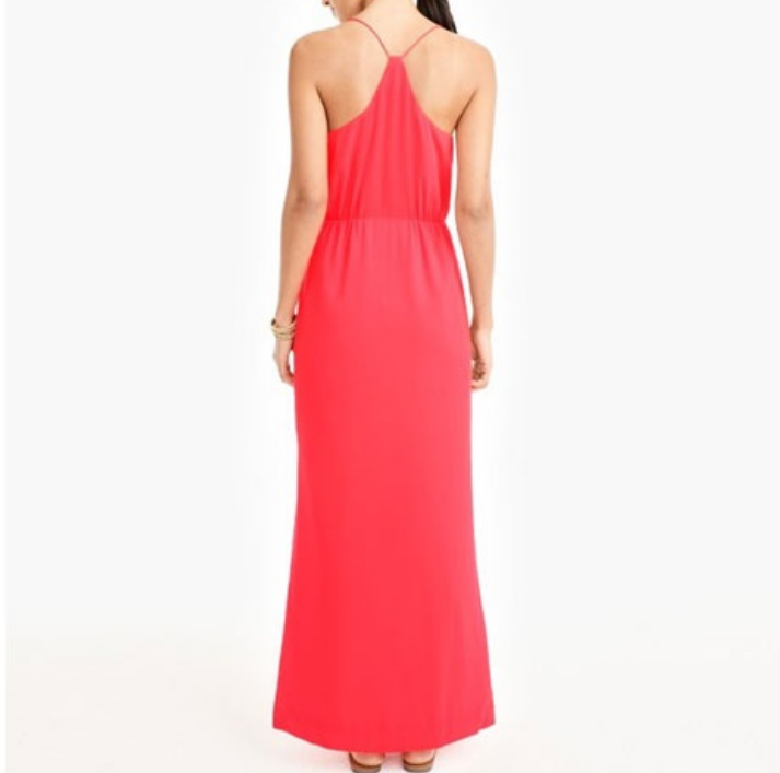
Racerback Maxi Dress from JCrew Factory - $59.50