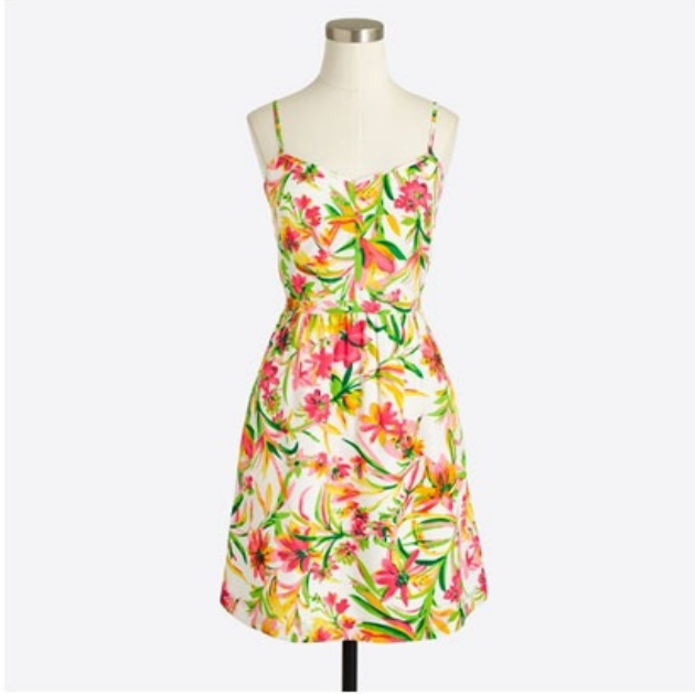
Printed Seaside Cami Dress from JCrew Factory - $65.00