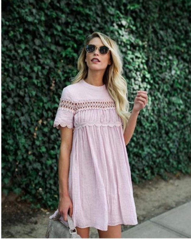
Marketa Dress from Vici - $54