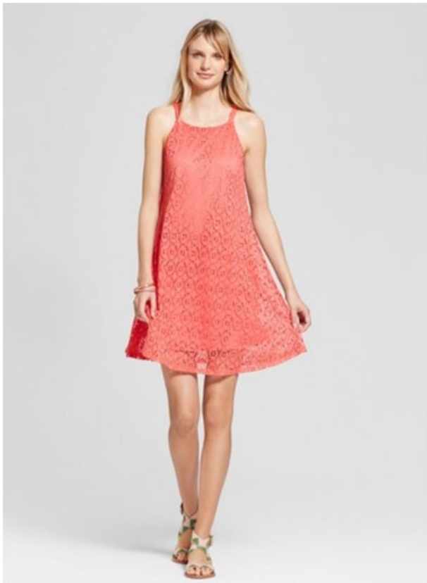
Women's Lace Trapeze Tank Dress – Lux II - from Target - $29.99