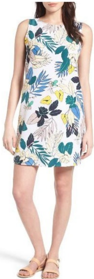
Sleeveless Shift Dress from Halogen - $58

If you want to feel the summer vibes through your clothing without spending too much money, here are twenty summer dresses that won't break the bank. Pick a couple to add to your wardrobe and you'll be glad you didn't splurge.