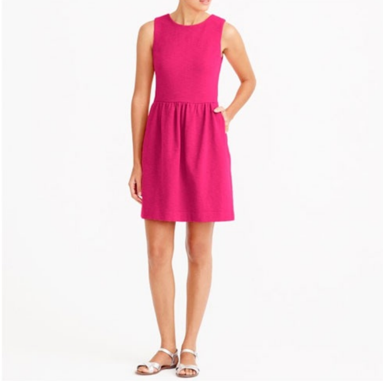
Daybreak Dress from JCrew Factory - $44.50