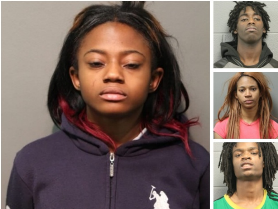
The four teens

[caption id="attachment_107895" align="aligncenter" width="638"]