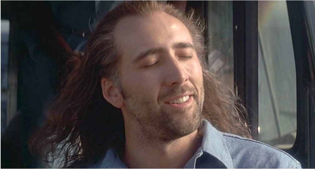
Nicolas Cage can smell the

[caption id="attachment_107303" align="aligncenter" width="660"]